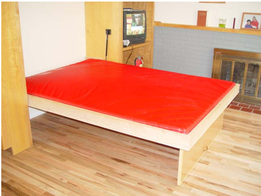
Murphy Exercise Platform And Entertainment Center Makes use of limited space